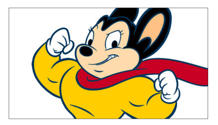
Power or ability to accomplish something

Tell the story if the widow's mighty mite in a new way. Explain to the kids what mighty means and what a mite is using pictures to help illustrate. Then retell the story below holding up the appropriate picture for the kids to fill in the appropriate word.