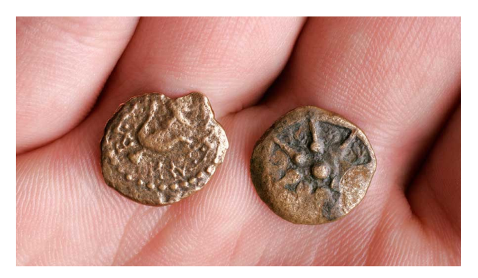
A coin of small value in Jesus' time (2 coins equaled less than a penny today)

So listen closely my friends while I tell you the story of the mighty mite!