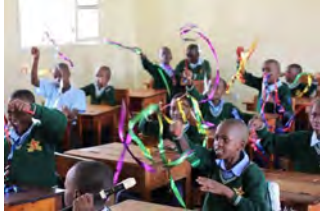
Students at the Kibeta English Medium Primary School (KEMPS) in Bukoba, Tanzania.

The Tanzania Companionship Committee provides support between this synod and the North Western Diocese (NWD) of the Evangelical Lutheran Church in Tanzania (ELCT). This relationship has been thriving for 15 years