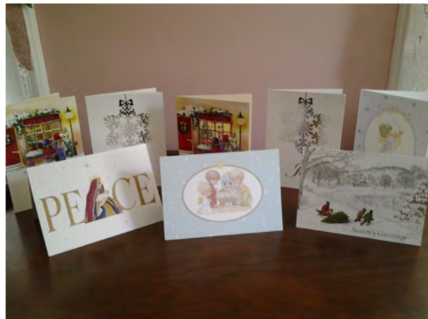
Christmas cards sent to synod congregations and communities affected by Sandy, from WELCA of Covenant Lutheran Church, Wheatland, WY.

We have several years of recovery ahead of us; the work goes on. At the same time we must look beyond recovery toward resiliency. As recovery and rebuilding continue we will also make our plans for protection and resilience in the next disaster. Our synod will develop a disaster plan that will include establishing systems for communication and response so that we will be better equipped when the next storm hits our area.