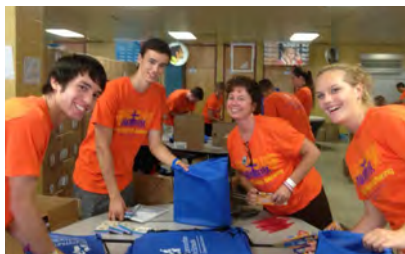
A group putting together school supply bags at the National Youth Gathering.