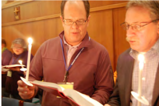
Evening Prayer at this year's Bishop's Retreat in November.

During the course of this last year the committee discussed and developed a proposal which recommends the type of bread and wine to be used in synodical celebrations of Holy Communion. In a