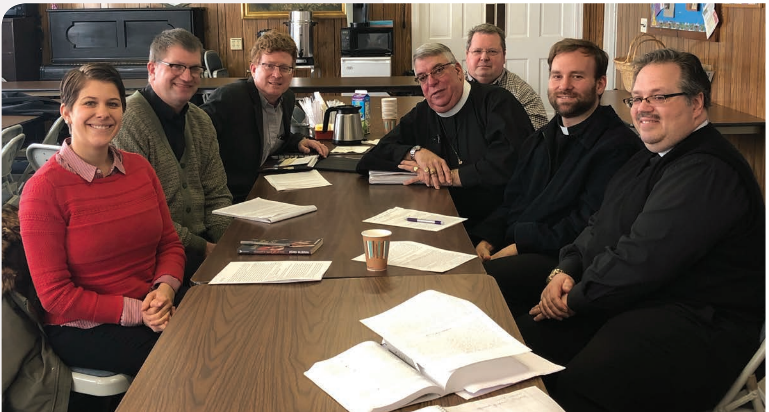
Pastors of the Eastern Nassau Conference at their weekly Bible Study

The collegiality and collaboration among the pastors of the Eastern Nassau Conference is a sustaining force for many of us, and certainly for me personally, as Dean. In the fall, I took 12 weeks of maternity leave following the birth of my baby boy, and many of my colleagues were eager to help in any way they could. They attended council meetings on my behalf and were on call for emergencies; offering general support and encouragement. This is just one example of the collegiality we experience in our conference, making us stronger, healthier pastors, and enabling us to sustain stronger, healthier congregations.