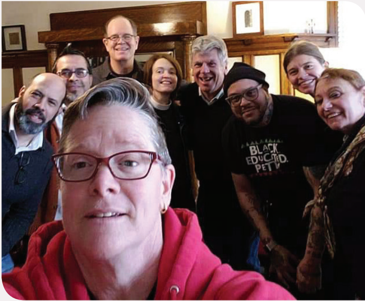
Brooklyn Bridges has the best pericope study EVER!

THE MNYS BROOKLYN BRIDGES CONFERENCE PASTORS SUPPORT ONE ANOTHER VERY STRONGLY. Each week, they gather for pericope study at St. John-St. Matthew-Emanuel Lutheran Church. Pastors from three different conferences regularly attend this weekly group.