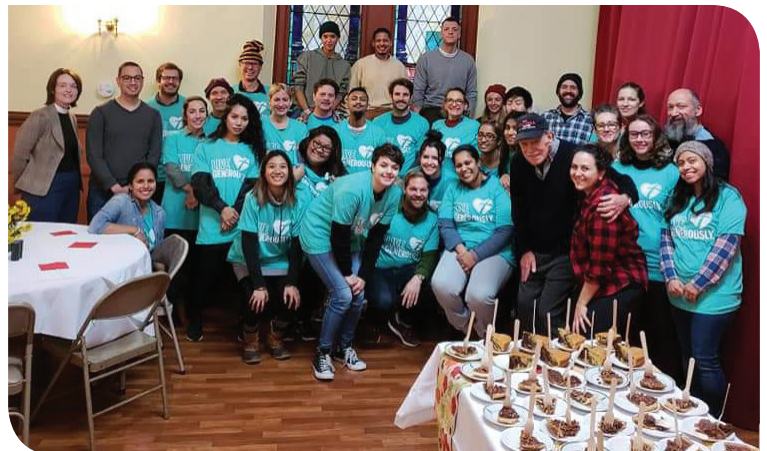
Community Thanksgiving Meal hosted by Park Church Co-op and St. John's Lutheran Church