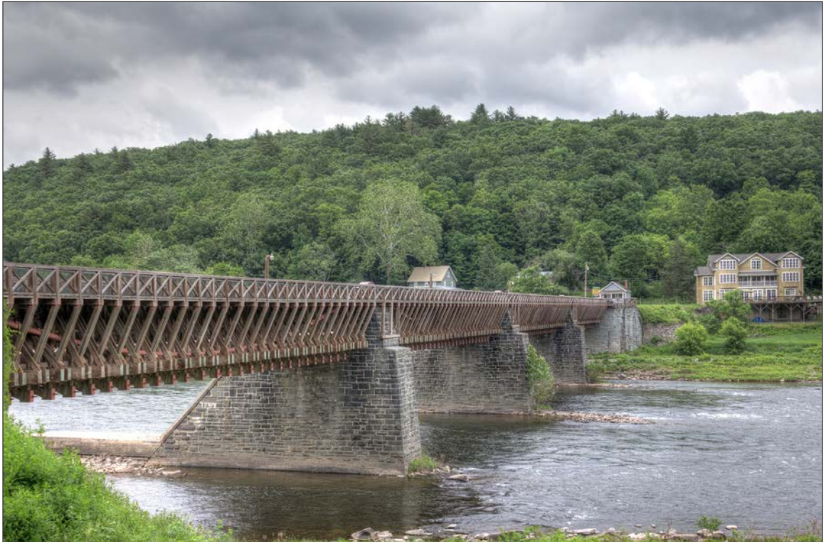
Roebling Bridge, Delaware River