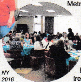
Metro NY WELCA Gathering 2016

Metro NY WELCA Gathering, September 16, 2017 at the Wartburg, Mt. Vernon, NY. Registration information will be sent to every congregation in Metro NY Synod the beginning of June.