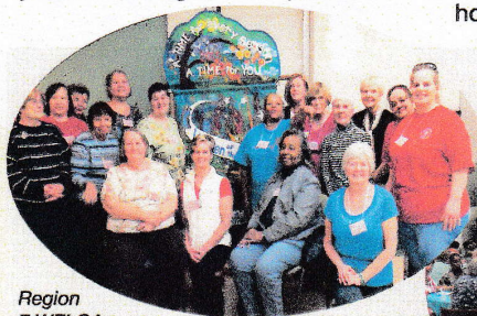
Region 7 WELCA Retreat Metro NY Group

Attend our Gathering on September 16, 2017, the churchwide WELCA Triennial in July 2017 or the Region 7 WELCA Retreat in April 2018.